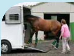
LOADING AND TRAVEL

Start a new dialogue about behavior. Ask your veterinarian about Zylkene® Equine.