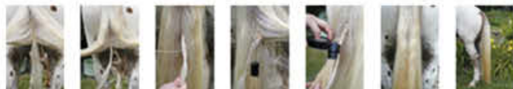
Step 1 Step 2 Step 3 Step 4 Step 5 Step 6 Step 7

And a final note, DO NOT keep your tail extension in after you show! Doing so is the recipe for all kinds of problems, including damage to the horse's existing tail if the extension is suddenly yanked out. Visit our page on CARE AND TIPS for additional care information.