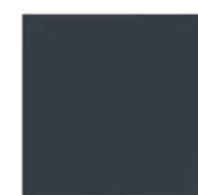
New Navy PMS 533C