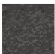
Carbon Heather PMS 7540C