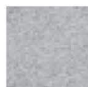
Heather Grey PMS COOL GREY 6C